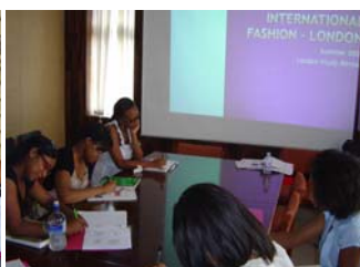
Students take notes during class session